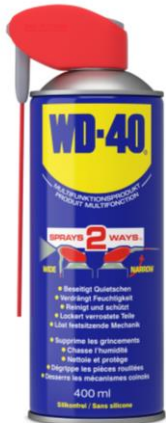
WD-40® spray can 400 ml smart straw®