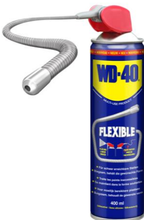
WD-40® spray can 400 ml 'FLEXIBLE' with high-quality, individually adjustable metal spray hose