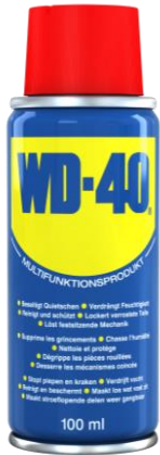
WD-40® spray can 100 ml