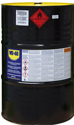
WD-40® barrel 200 liter