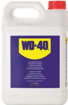
WD-40® canister 5 liter